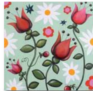
One of Wendy's paintings

We are also delighted to be joining Wendy for 'Art in the Gardens' at the Botanical Gardens on 6th and 7th September 2008 – 10.30 am to 5.30 pm. We hope you will come and see us and will remind you nearer the time to pop along.